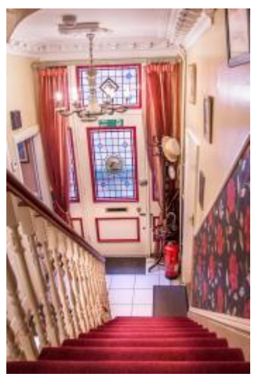
Front Door From The Stairs Inside