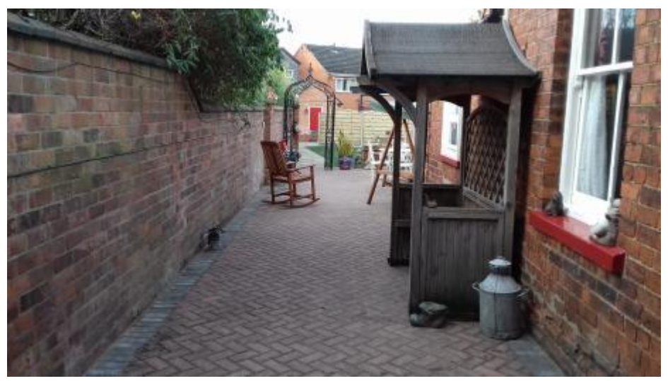
Smoking area and shelter