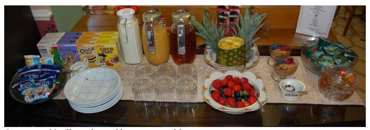
Continental buffet either self service or table service on request.