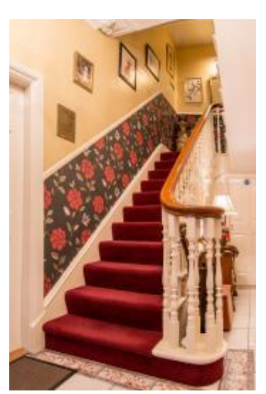
Stairs with low level lighting