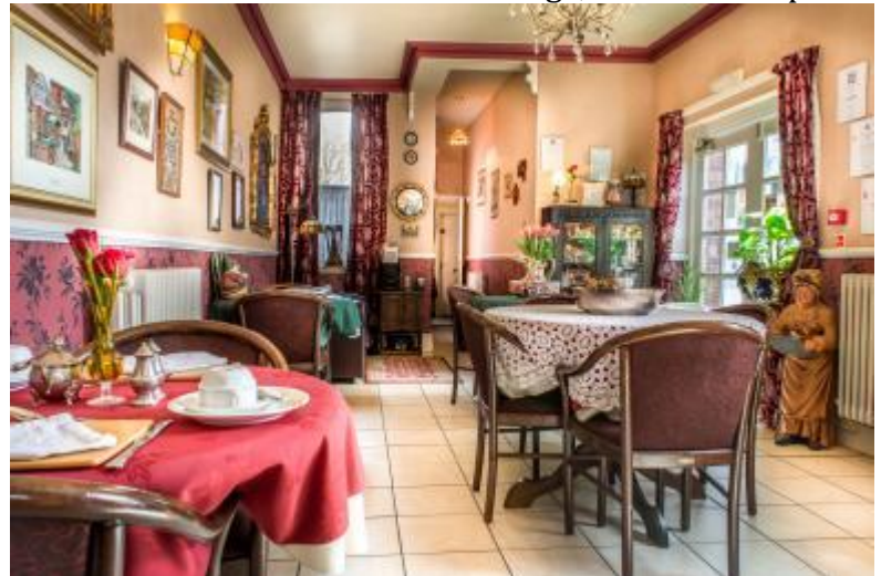
The Guest Day Room

• From the main entrance to the lounge, there is 1 step. There is no lift and no ramp.