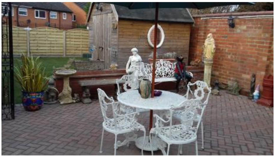
Patio Beside Entrance Door

There is a drop-off point at the main entrance. The drop-off point does not have a dropped kerb.