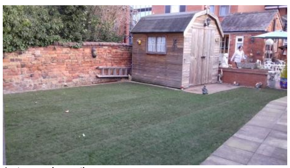
Assistance dogs toilet area.